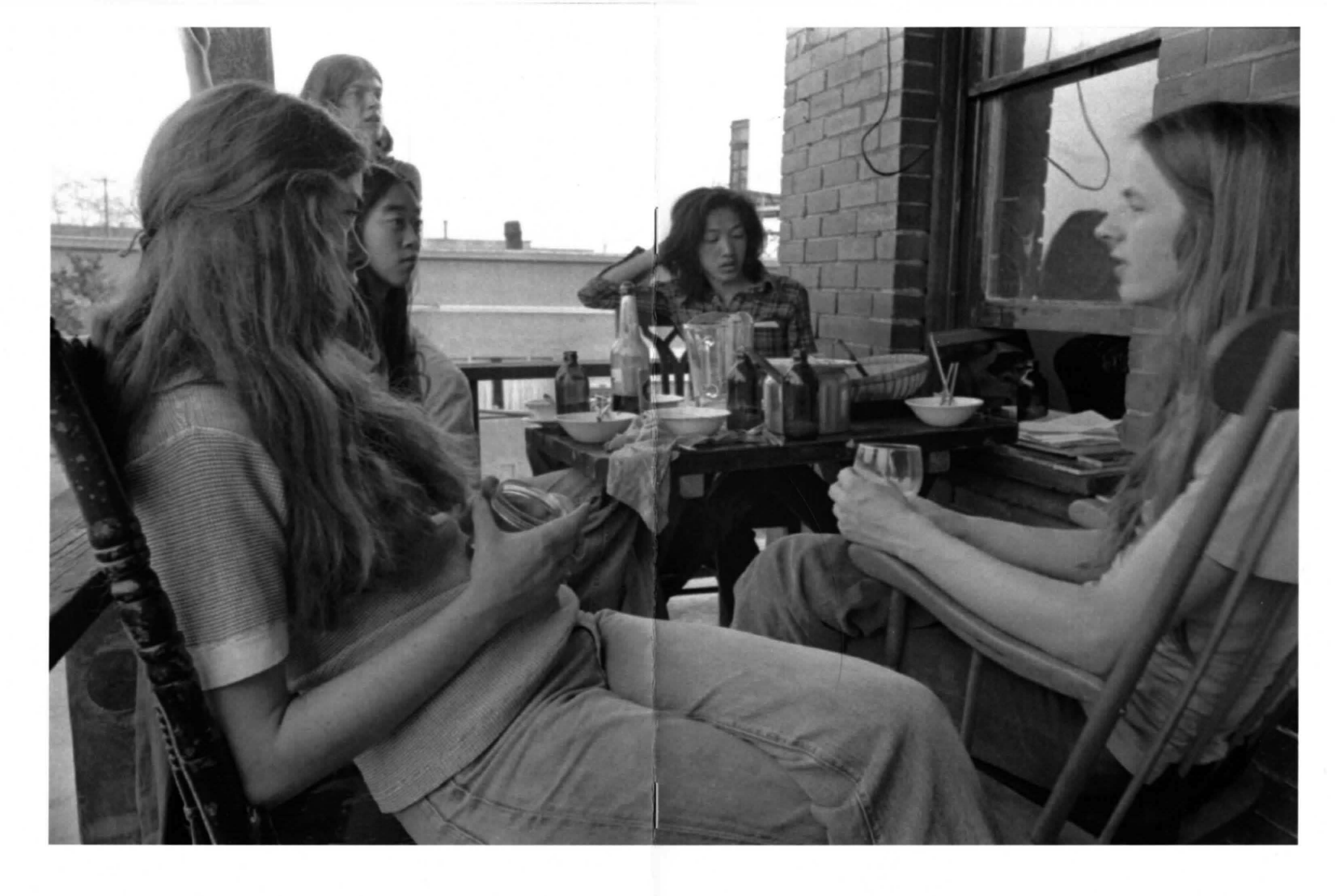
MAINSTREETERS: Taking Advantage, 1972–1982 January 9 – March 14, 2015 | Satellite Gallery